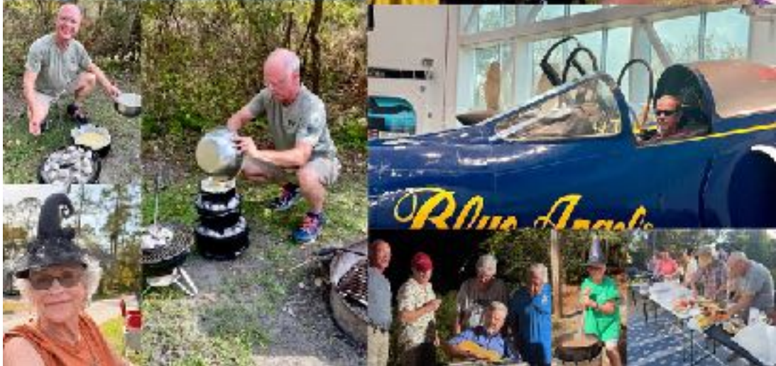
BLUE ANGEL'S RALLY