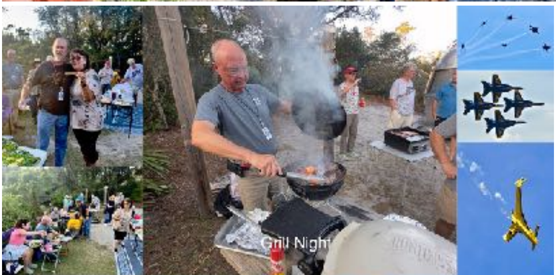
BLUE ANGEL'S RALLY