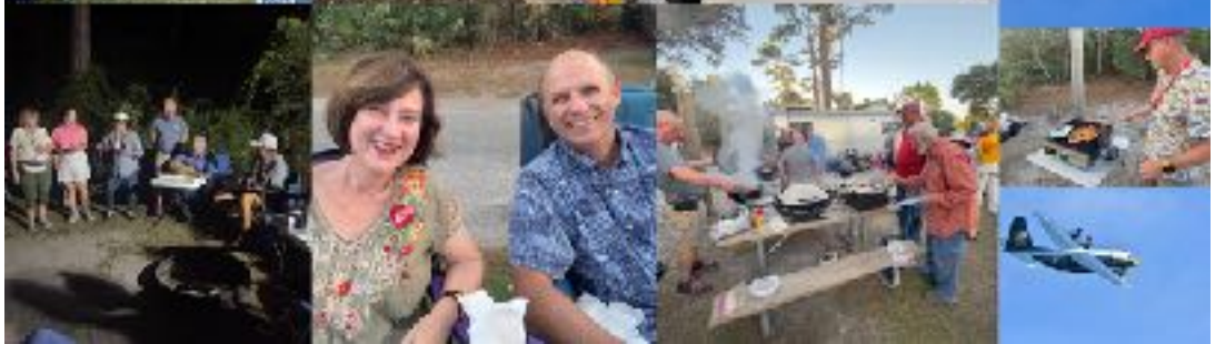
BLUE ANGEL'S RALLY