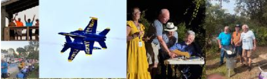
BLUE ANGELS RALLY