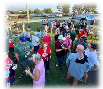
One of many G&G Happy Hours