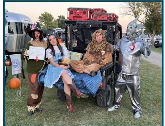
Live Music by The Lost Lugnuts and Costumed Attendees for the Vintage Airstream Club Gathering