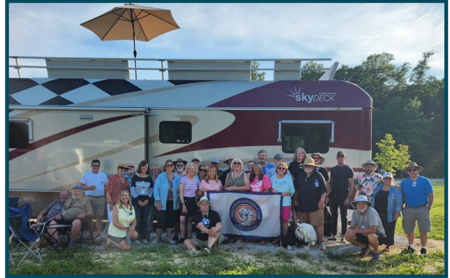
Indiana and Northern Illinois Club Joint Rally: