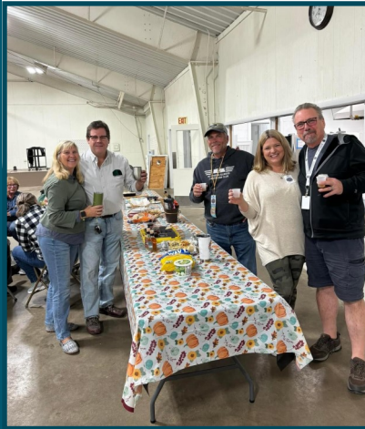
Northern Illinois Club Events: