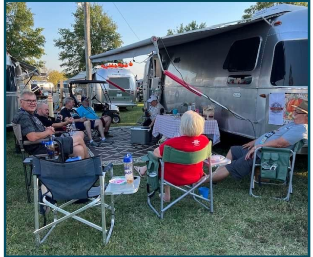
Chili Dinner with Indiana Club Members