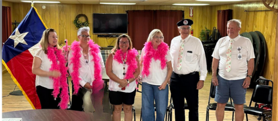
Your 2024-2025 Officers!