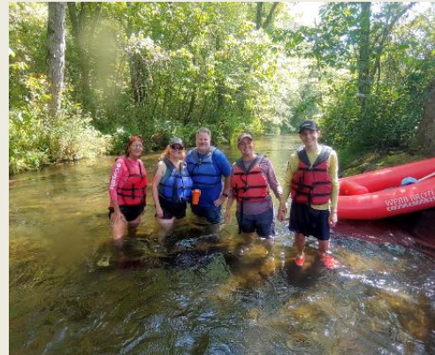
Webb Brother's Rafting on the Hiwassee River