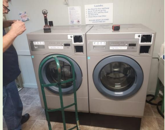
We have new washing machines! (They are wonderful!)