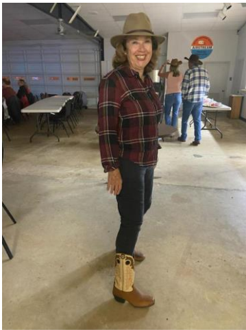
Good times and good friends during the Fall Rally