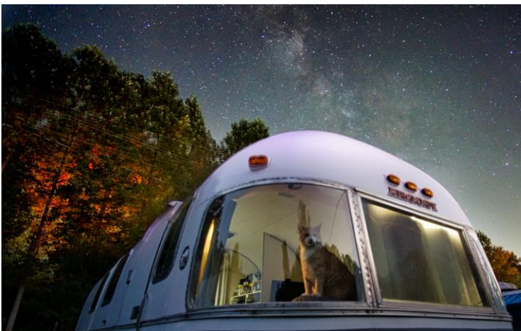
Wally and the Milky Way