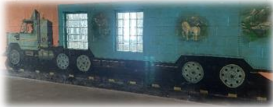
Glass Museum [Debbie May 4446]