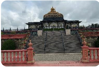
Outside and inside the Palace [Debbie May 4446]

We even had a few very brave members who went up the climbing wall at the RV park.