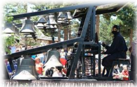
Bronze Bells ring out music and Tree Man Statue