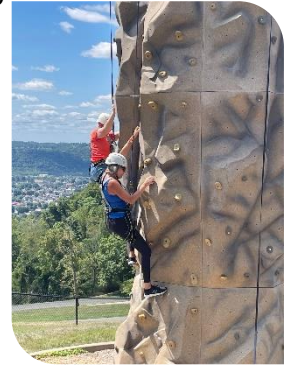
Climbing wall and Moonrise [Al Akers 24901]