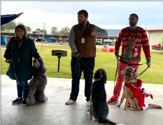
Canine Catwalk at the December Rally

Proceeds collected from this year long raffle are to be donated to the Team Red White & Blue Veteran's Community.