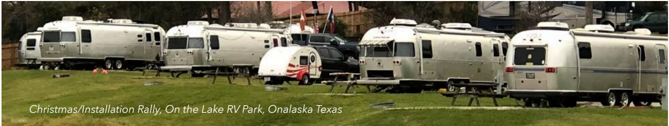
Christmas/Installation Rally, On the Lake RV Park, Onalaska Texas