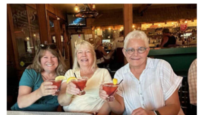
A huckleberry toast in St Regis.