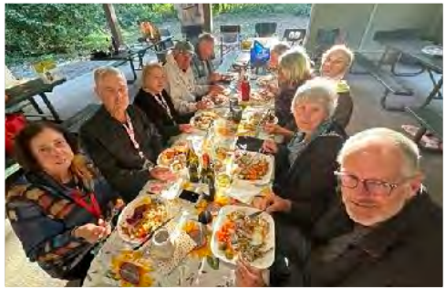
Wonderful turkey dinner