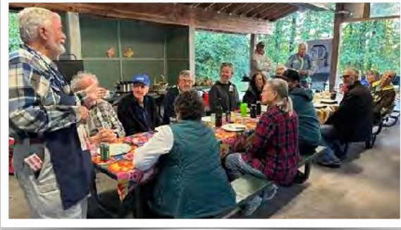
Trenor welcoming everyone