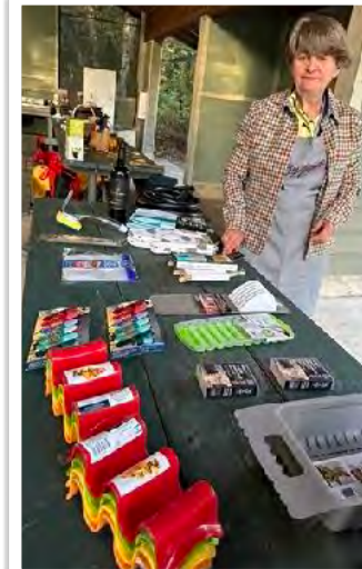
Some draw gifts