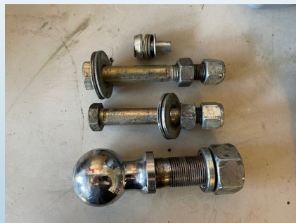
Hitch Bolts & 2 5/16 Ball 12,000 Lb.