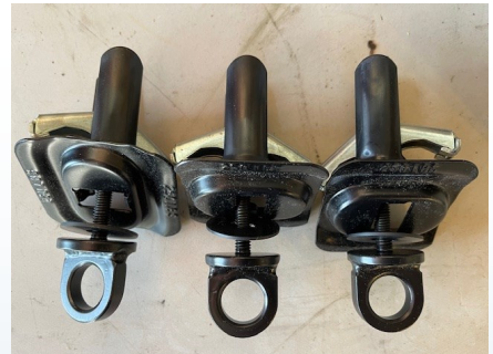
GMC Truck Tie Downs