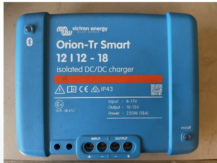
New Orion DC Charger