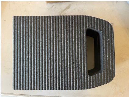
4 Heavy Duty Pads

If interested in two Lifeline Batteries, Please contact Tim McDow at 561-758-9652