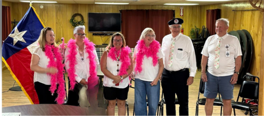
Your 2024-2025 Officers!