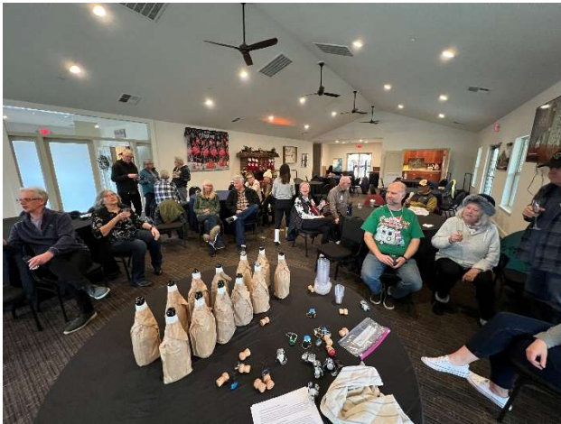
Sparkling Wine Tasting – Black Oak Rally