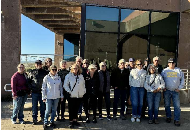
Bodega Bay Marine Lab Field Trip