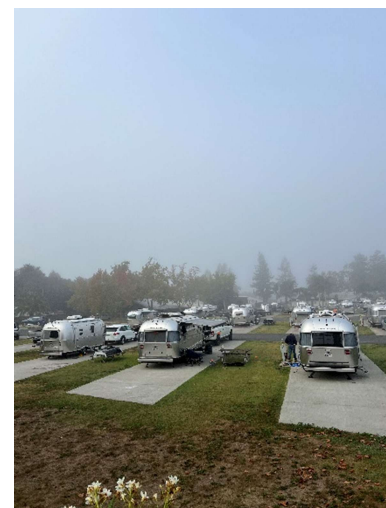
Early morning fog Newbie Rally