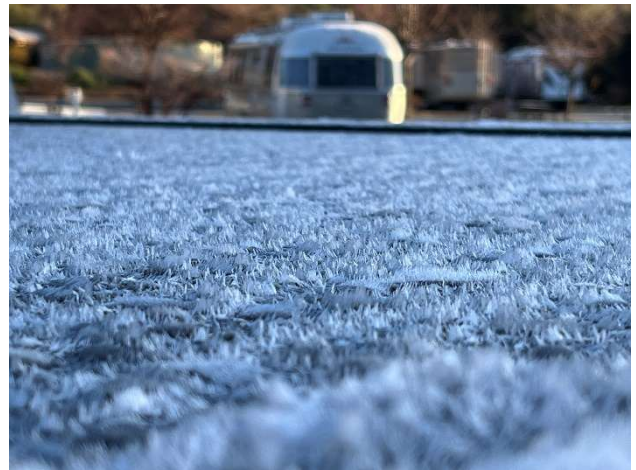
It was cold at Black Oak!