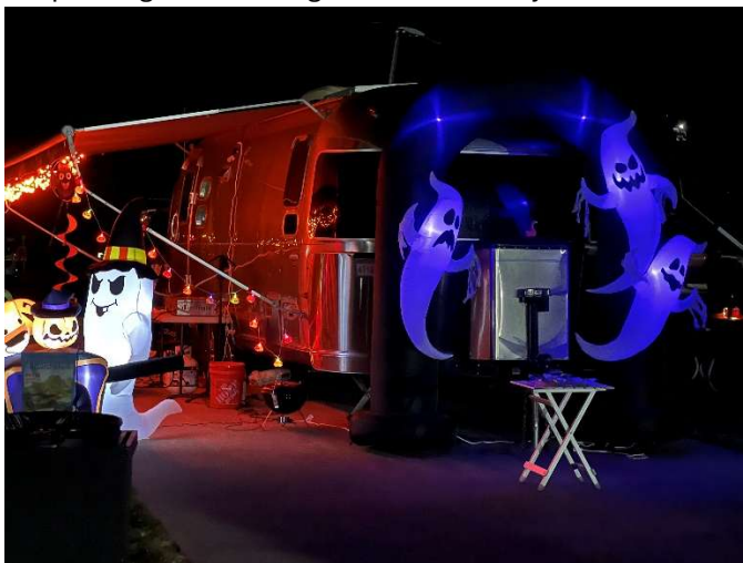
Newbie Rally Halloween Decoration Contest