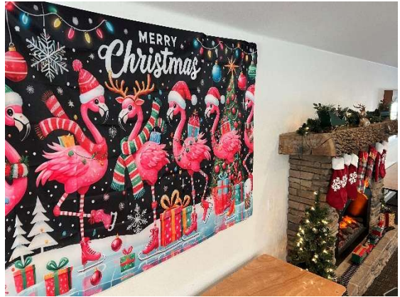
Black Oak White Elephant Rally