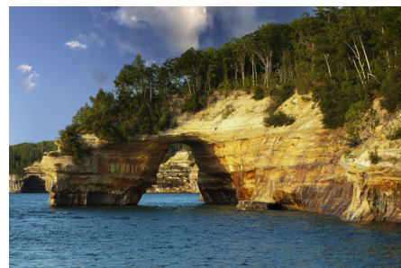
Pictured Rocks National Lakeshore on Lake Superior