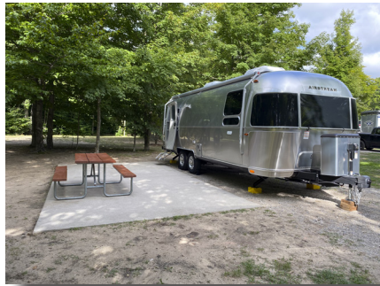
Our campsite at Indigo Bluffs RV Park in Empire, MI