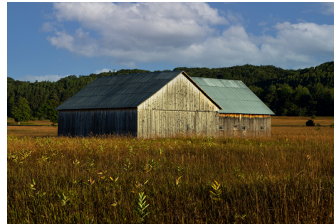
Beautiful buildings like this can be found in abundance