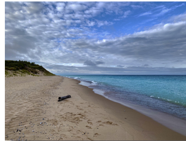
Lake Michigan at the lake end of the Dune Climb in Sleeping Bear Dunes