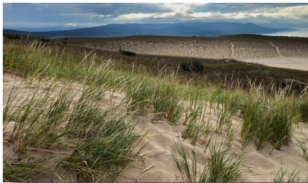
Beginning of the Dune Climb in Sleeping Bear Dunes