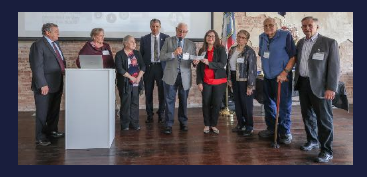
Team Red White and Blue, Receiving the check