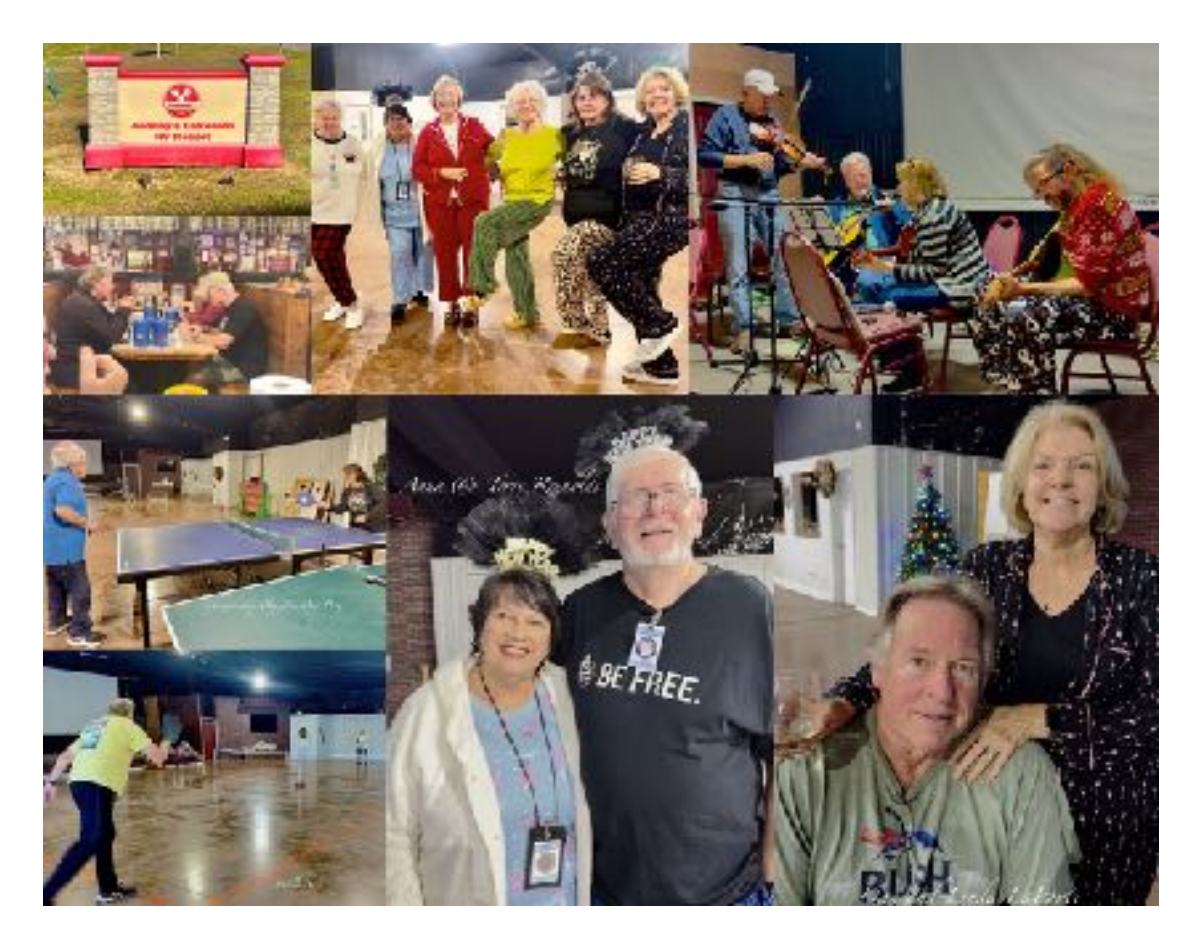
Type to enter text