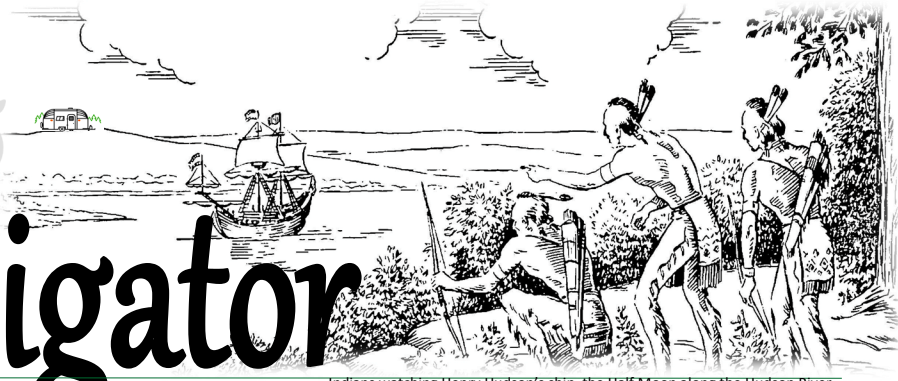
Indians watching Henry Hudson's ship, the Half Moon along the Hudson River