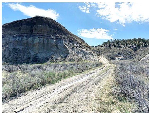
Lower Two Calf Trail Upper Missouri River Breaks National Monument.

Our first stop was another such town, Malta, Montana, population about 1,900. Nearby, members of Butch Cassidy's gang (though not the man himself) robbed a Great Northern train in 1901. However Malta is most famous, at least among paleontologists and dinosaur cognoscenti, for the nearby 2000 discovery of "Leonardo", a fully articulated and partially "mummified" skeleton of a subadult Brachylophosaurus , over 90% complete, uncompressed, and including skin and muscle impressions, parasites and malignant tumors (dinosaurs had cancer too! who knew?), that is considered one of the most spectacular dinosaur finds ever, and is included in the Guinness Book of World Records . It is on display at the Great Plains Dinosaur Museum in Malta.