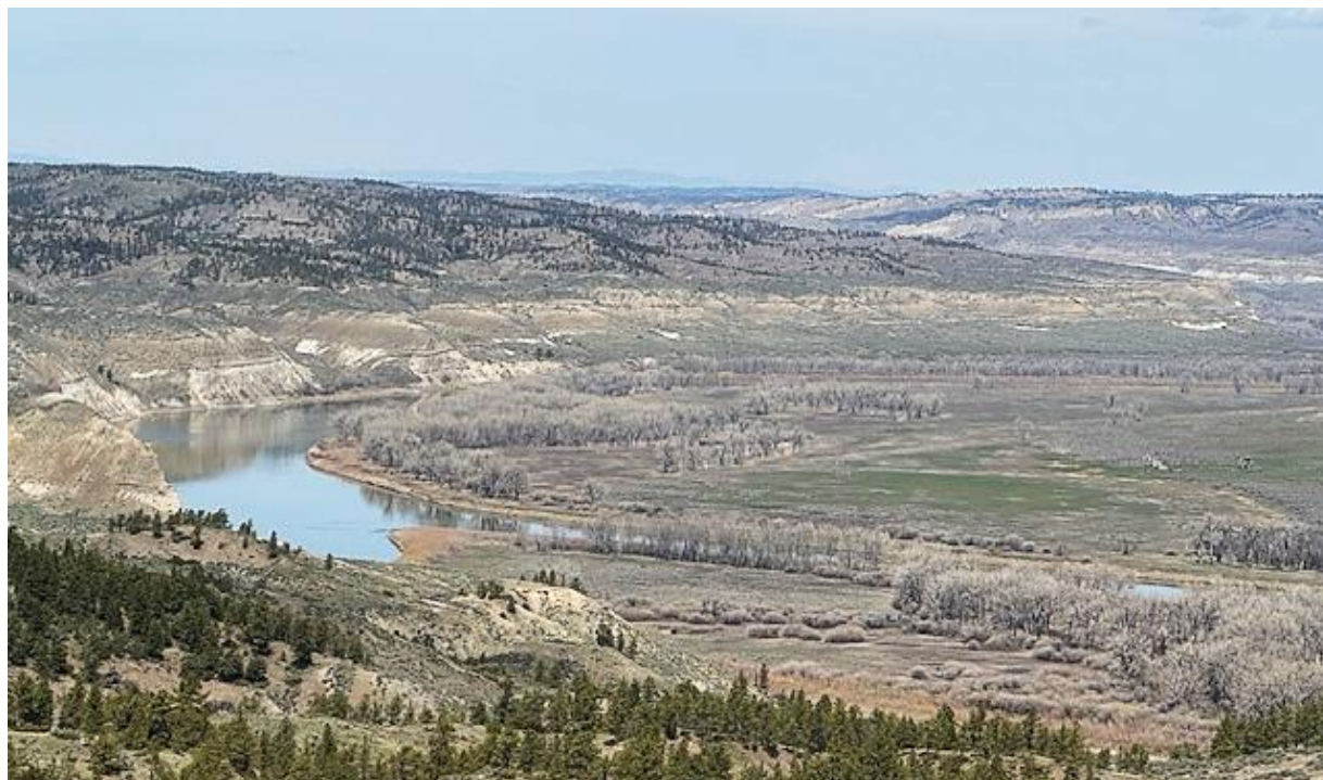
View of the Missouri River looking west from Lower Two-Calf trail, Upper Missouri River Breaks National Monument.

The next day we drove from Malta to the monument's east "entrance", actually just a dirt road access point. This drive revealed two things: the James Kipp Campground had only half a dozen trailers in it (out of 24 spaces), so we could have stayed there, but the first 15 or so miles of US route 191 out of Malta, the only road to get to the monument, was completely gone. The former road, US 191, was apparently being widened and all there was to travel on was a wide, undifferentiated dirt path that seemingly had just been carved from the