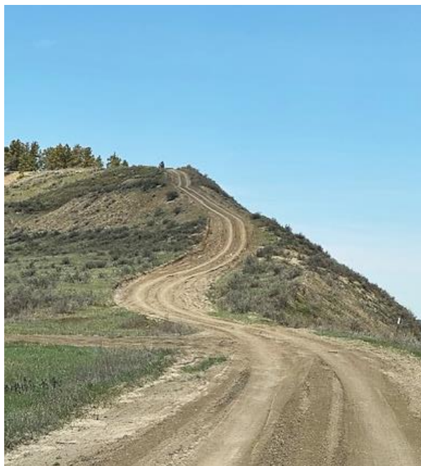
Lower Two-Calf Trail, Upper Missouri Breaks River National Monument.

(chocolate milk, maybe) and a busy Hi Line railroad bridge that crossed it. Trains of a hundred or more cars thundered by every forty-five minutes or so throughout the day and night. The only other trailer in the park was occupied by two thirty-something men who blasted country music all night long. We turned the heat pump fan on high to drown out the noise and managed to sleep reasonably well.