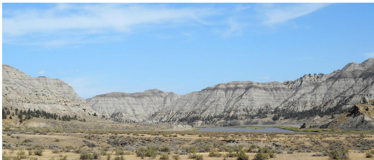
Upper Missouri River Breaks National Monument.

The next day we left Malta and headed east for Medora, North Dakota. Next time: the south unit of Theodore Roosevelt National Park.