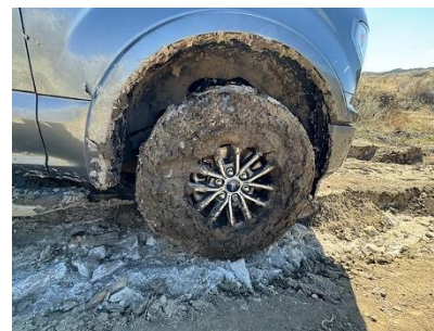
Trail's end; at least, our trail's end. Couldn't get past the first creek.

raw earth. Spring is, it turns out, highway maintenance season in Montana and in all we drove at least 80 miles on raw dirt roads, often following an official vehicle with flashing lights and a “follow me” sign, winding through active construction sites and scores of earth-moving equipment. At least the trip from Malta to the monument and back was without the trailer. It was, however, notably, and a bit surprisingly, without cell service.