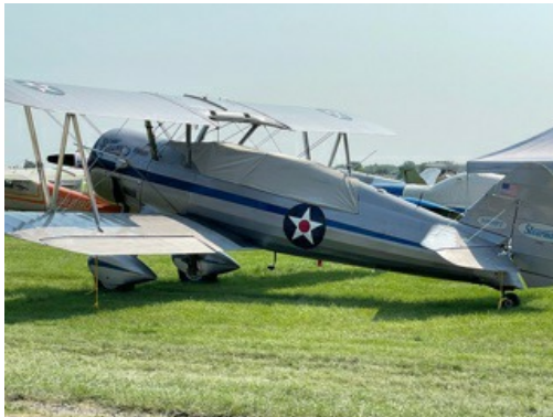
One of the many war birds on display

Everyday we were treated to a variety of flying stunts and flybys with vintage aircraft and war birds. Besides watching planes flying and doing stunts, one could walk around and view the many planes that had parked on the lawn areas around the airport. Over 10,000 planes parked at Oshkosh this year compared to 5,000 on an average year.