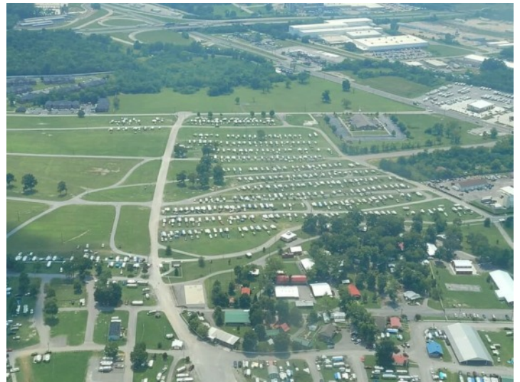
2021 WBCCI International at Wilson County Fairgrounds in Lebanon, TN.