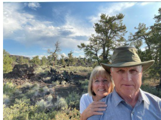
Craters of the Moon Nat. Park, Idaho

In Montana, we visited The Little Bighorn Battle Field. At Idaho Falls, we rode our bikes along the River Walk. Also in Idaho, we went to Craters of the Moon National Park and stopped at Shoshone Falls, which were more of a trickle than a fall.