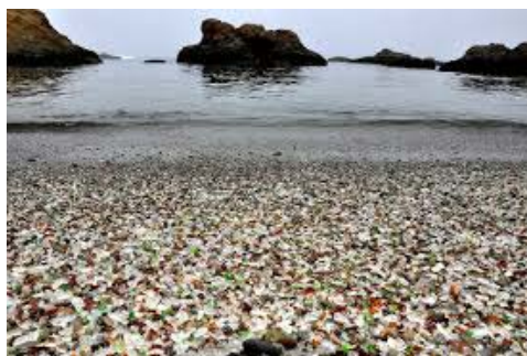
Glass Beach, Fort Bragg