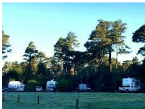
Pomo RV Park

Site seeing opportunities abound with Coastal Trails, State Parks, Beaches, Headlands – all with plenty of open space. Fort Bragg, and neighboring Mendocino, typically have lots of shopping and dining; we'll see what is open in August.