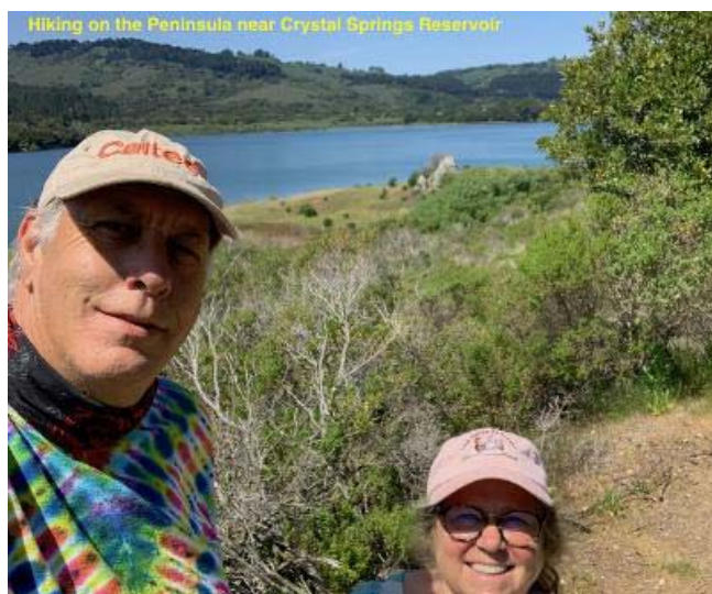
Hiking on the Peninsula near Crystal Springs Reservoir