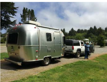
We agreed to do some research and ended up offering $32,000.

Neither of us had looked at Airstreams or really any trailers with actual intent to purchase so we had no idea of the cost. When I pointed out the true cost, she balked.