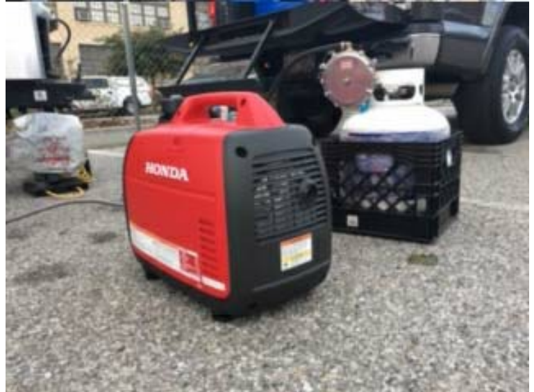
Honda EU2200i with Hutch Mountain propane conversion and adapter attached to external propane canister during Rose Parade Rally. With additional connections, it can be also be attached to the trailer's tanks.

Eventually, we chose a Honda conversion kit from Hutch Mountain, a highly-rated Utah-based company. https://www.hutchmountain.com/ Hutch Mountain offers two options: (1) they can supply you with all you need to do the conversion yourself on your self-purchased generator (there are many Utube videos of the process) or (2) they can sell you the conversion kit, facilitate the purchase of the generator through a local Utah company, have a local contractor professionally install the conversion kit for $60.00, and ship it to you, ready for use. We chose to have the kit installed on the Utah generator, and, although more pricey than the DIY option, it worked out great for us. Plus Hutch Mountain's customer service was fantastic. We later bought a quick disconnect set-up so we can run the generator with our Airstream propane tanks when desired.