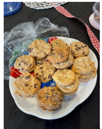
Cookies, cookies, and more cookies!