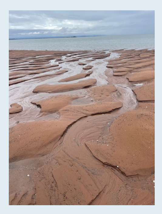
FREE STANDING WATER SHAPED OCEAN FLOOR

A great way to experience the Tidal Bore is to book a rafting experience with Shubie River Wranglers in Truro about 1hour 30 mins from Parrsboro. I was very hesitant to do this and didn't sleep well the night before because I was worried about falling out of the zodiac boat. However, the guide said you will not fall out of the boat unless you really want to fall out. This made me feel so much better! We did the 2 hour trip (Trip A) for $72.00 CAD.