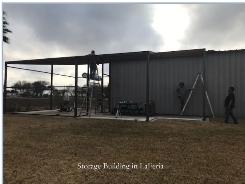
Storage Building in LaFeria