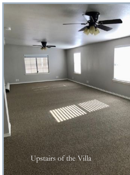
Upstairs of the Villa