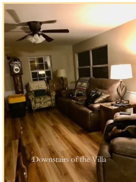
Downstairs of the Villa

Our new mailing address is 200 Walnut Hill Ave, #57, Hillsboro, TX. 76645. Our Villa number is 201A. Wishing everyone good health and safe travels.