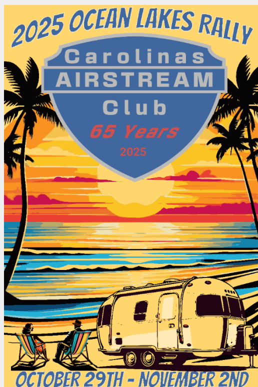
Poster art by Tabb Adams .

Christmas At Biltmore Estate Rally November 10-13