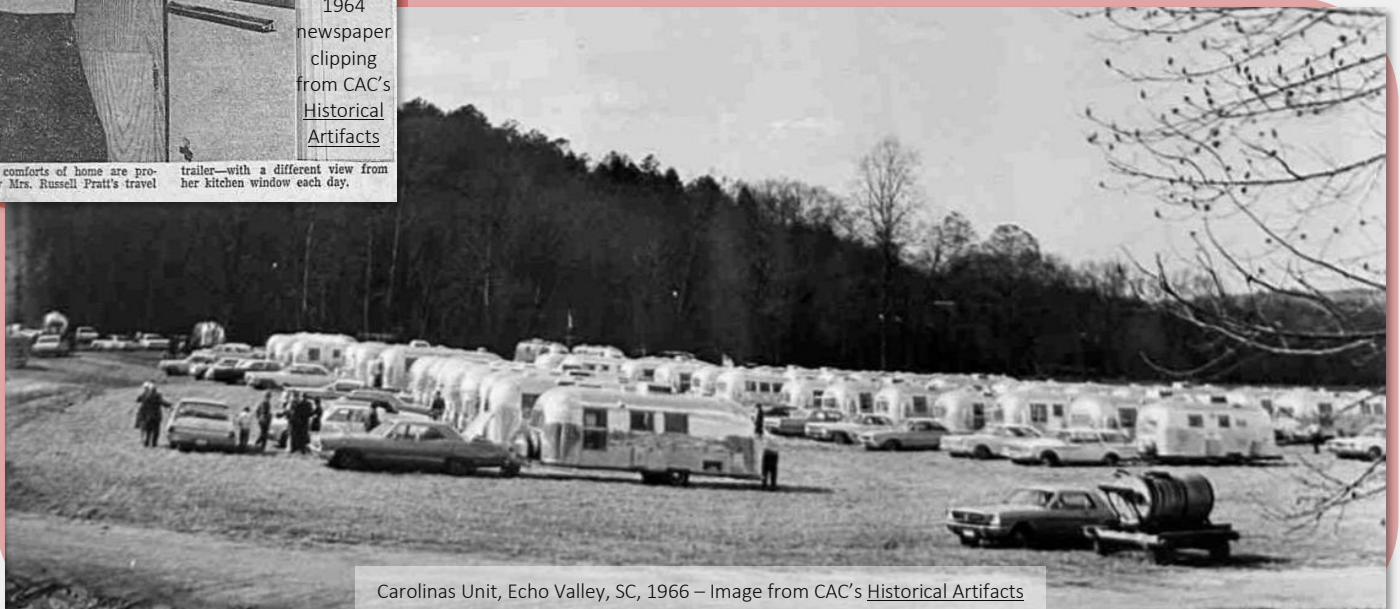
Carolinas Unit, Echo Valley, SC, 1966