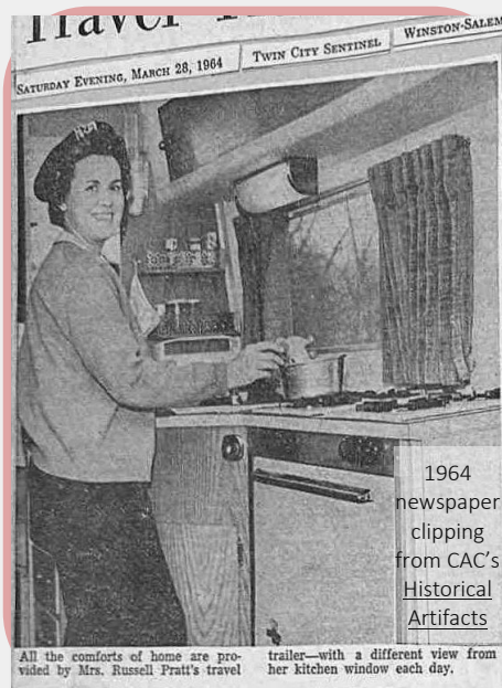
1964 newspaper clipping from CAC's Historical Artifacts

Thank you for helping the Carolinas Airstream Club Celebrate Adventure & Community!