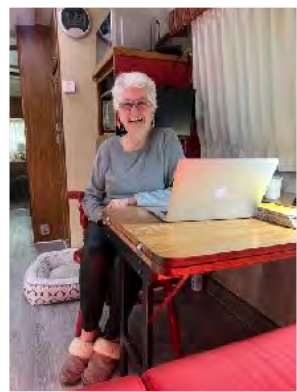
(Doing our newsletter in Airstream at Earl's Cove)

Dear Members of Airstream Club International Unit #121,