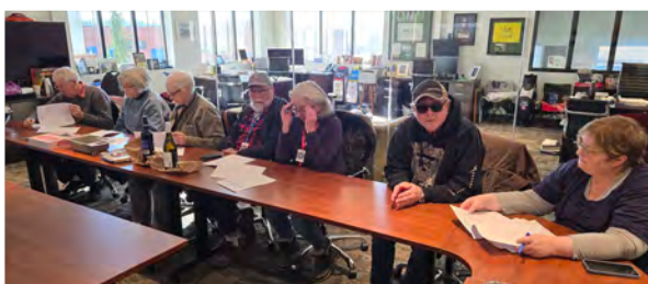
Photos from meeting at Traveland dealer