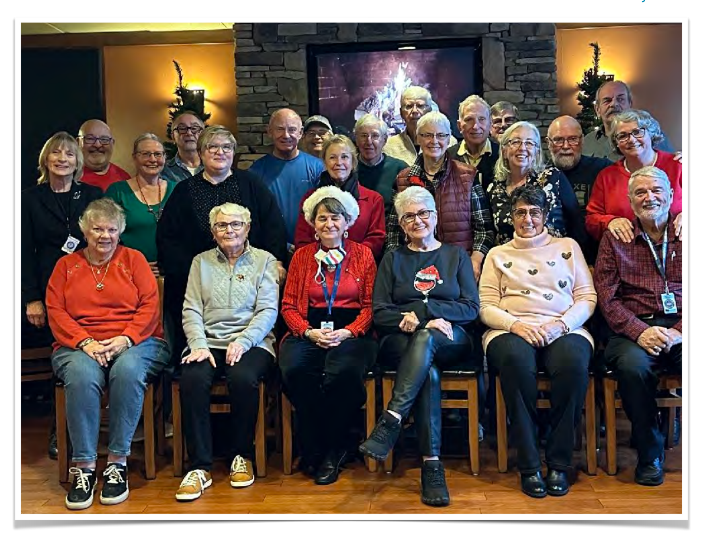
Christmas Luncheon Attendees