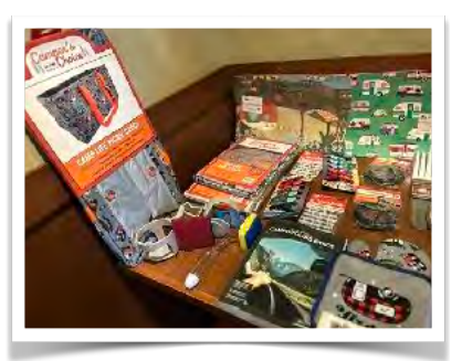
Gifts donated to the Luncheon