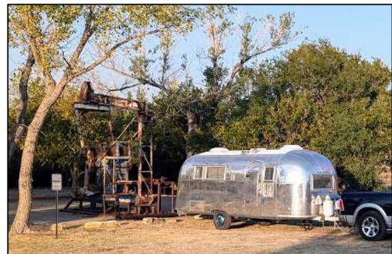
HH - Atlas Ad Astra Adventure Resort, Wilson, KS