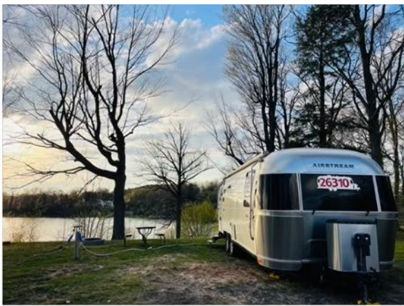
John Gurney Park