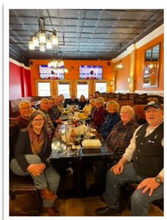
Mi Mezcal, Cadillac, MI

Luncheons bridge the gap between the rally seasons and brightens our lives.