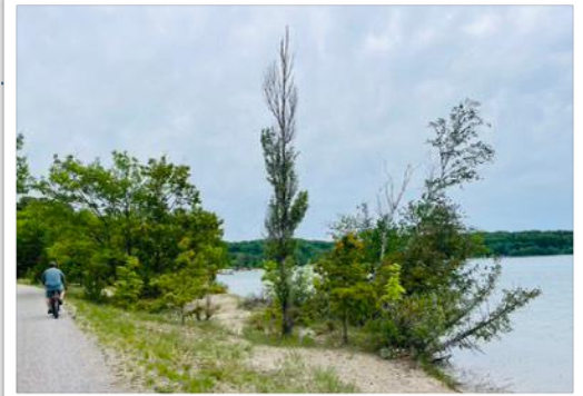
Crystal Lake Bike Path

campground will get you to downtown Frankfort - on Lake Michigan - in 3 gorgeous miles, and "turning right" out of the campground on the trail will take you on the most glorious bike trail trip to Crystal Lake and Beulah you'll find in Michigan. Part of the trail is packed gravel, but it's worth the slightly bumpy adventure for the scenery. The grassy sites at the campground are 30-amp tops, and we always reserve the pull-throughs for extra space. Stormcloud Brewing in Frankfort is on the bike-route itinerary when visiting Bestie River Campsite. The city of Beulah also recently opened their city-owned park to recreational (and not just seasonal-site) campers, and that is on our bucket list for this summer because we love that small town.