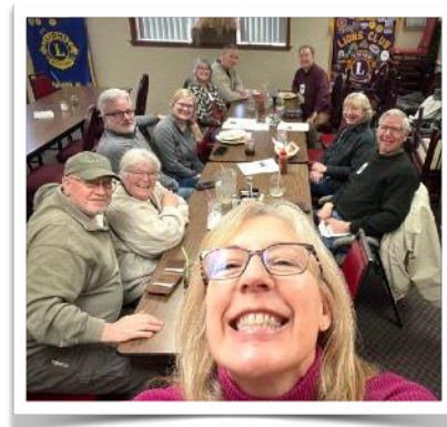
Iron Horse Pub, Durand, MI