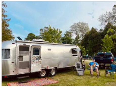
Betsie River Campsite

campground will get you to downtown Frankfort - on Lake Michigan - in 3 gorgeous miles, and "turning right" out of the campground on the trail will take you on the most glorious bike trail trip to Crystal Lake and Beulah you'll find in Michigan. Part of the trail is packed gravel, but it's worth the slightly bumpy adventure for the scenery. The grassy sites at the campground are 30-amp tops, and we always reserve the pull-throughs for extra space. Stormcloud Brewing in Frankfort is on the bike-route itinerary when visiting Bestie River Campsite. The city of Beulah also recently opened their city-owned park to recreational (and not just seasonal-site) campers, and that is on our bucket list for this summer because we love that small town.