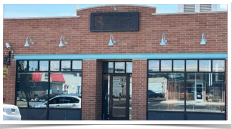
September 9, 2024

Those of us who attended the International Rally in Rock Springs, Wyoming may have visited Bitter Creek Brewing for dinner and a brew. I will always remember the Coal Porter. It was great. Unfortunately, they have closed their doors after 27 years of business. The owners decided to retire. Downtown Rock Springs won't be the same without them. Click HERE to read more..