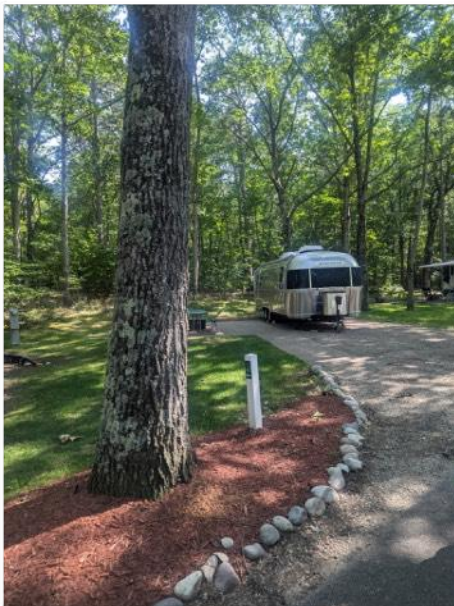
Indian River Campsite