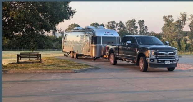
THE SWANGIN'S ON THE ROAD TO SEDALIA