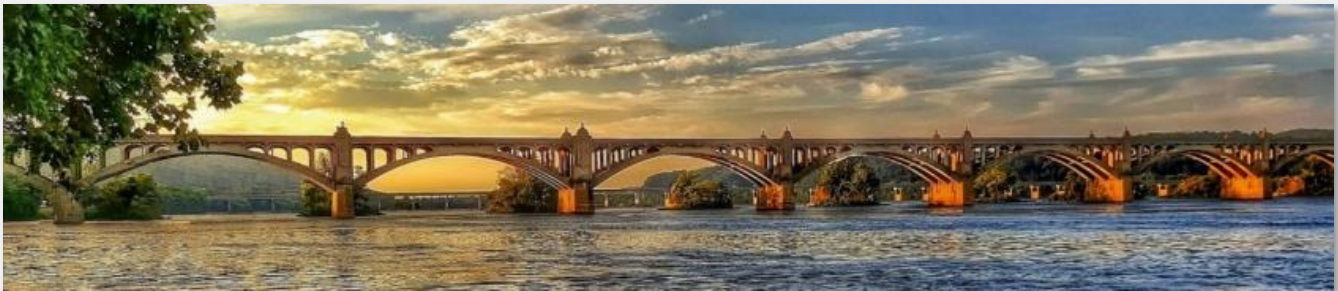
The Columbia-Wrightsville Bridge (also known as the Veterans Memorial Bridge or Route 462 Bridge) connects York and Lancaster Counties in Pennsylvania along Route 462 over the Susquehanna River. The bridge contains 48 spans, is 1.26 miles long, and is listed on the National Register of Historic Places.