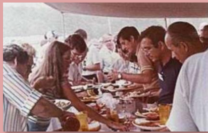
CAC, 1978 Linville Land Harbor

2025 marks the 65th anniversary of the Carolinas Airstream Club's charter. To mark the milestone, Tarheel Traveler is pleased to introduce this new section of the newsletter that will be dedicated to the anniversary. Be on the lookout for articles, links to photos and recordings, and information on how you can participate in the anniversary throughout the year and at the Anniversary Rally at Ocean Lakes in October of this year.