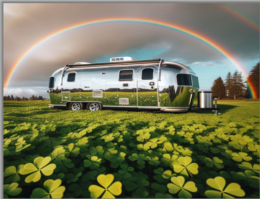
Photo generated with AI

“May the road rise up to meet you. May the wind be always at your back. May the sun shine warm upon your face; The rains fall soft upon your fields and until we meet again, May God hold you in the palm of His hand.”