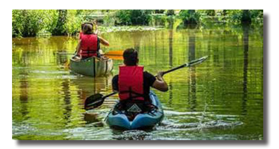
68th Airstream Club International Rally - August 23-28, 2025