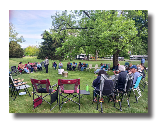
Installation Rally - November 14-15

The date has moved back to our original dates that the club voted on. 2025 Installation will be held on November 14-15 at Country Acres Campground in Lancaster, PA.