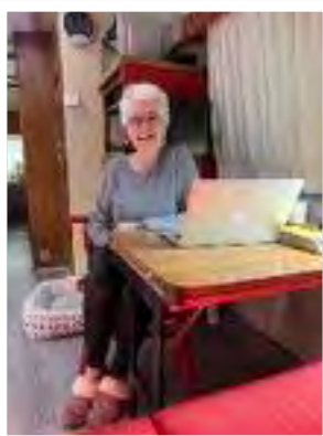
(Doing our newsletter in Airstream at Earl's Cove)