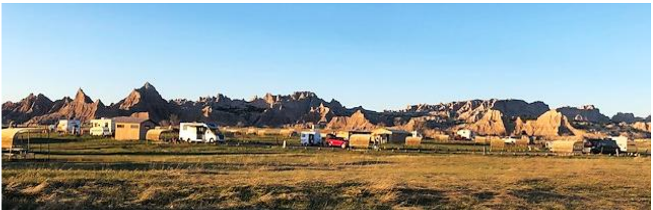
A view of the RV campground at Badlands National Park looking north towards the Badlands Wall, which separates the lower southern prairie from the higher northern prairie and is the most prominent feature of the South Dakota Badlands. These badlands are an island of eroded rock in a vast sea of grassy plains—the largest undisturbed mixed-grass prairie in the US. The grass grows wherever the soil contains sufficient nutrients while the badlands areas consist of soils that contain insufficient nutrients and thus are exposed to weathering.

Unfortunately, we will have to return for a more thorough exploration as our schedule limited us to just a day and a night at Badlands National Park before we had to resume our trip back to New Jersey. In the meantime, we have a lot of great photos to remember it by.