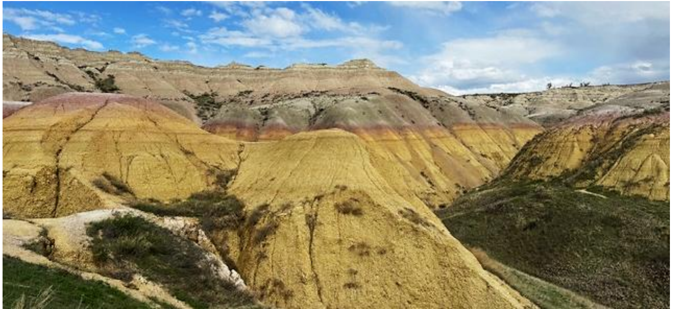
Paleosol "yellow mounds": shale seabed from the Western Interior Seaway that eroded into soil and then reformed into rock.