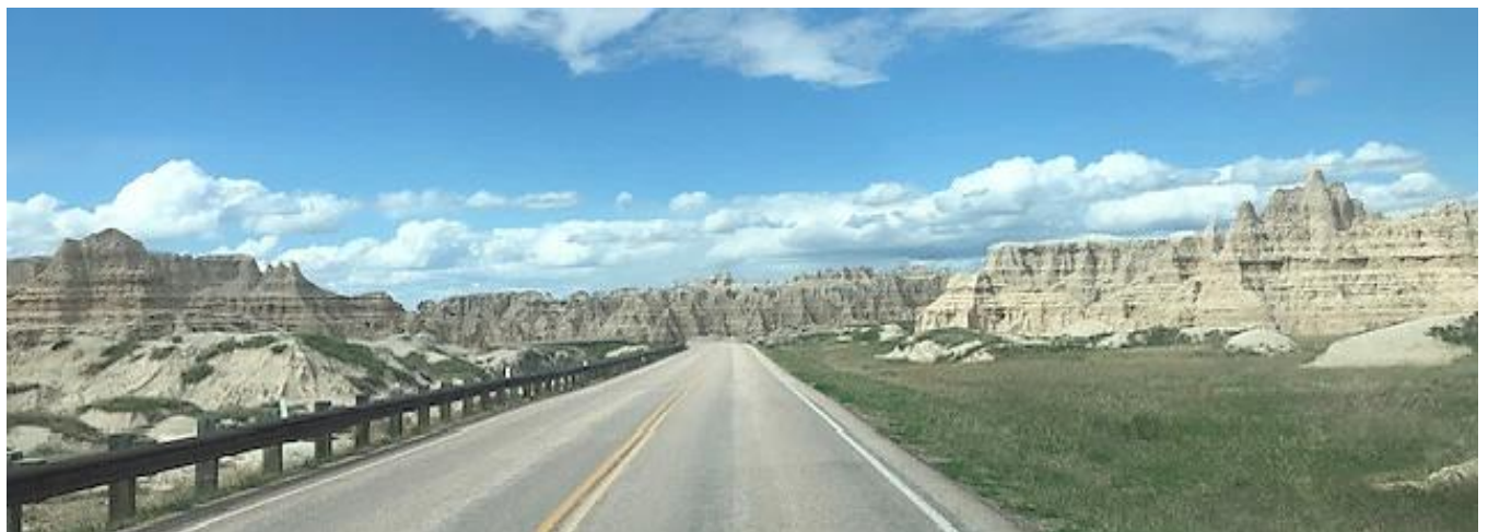
View from Sage Creek Rim road, the park's scenic drive.