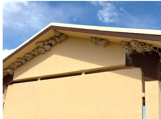
Left and right: Swallow's nests under a bathroom eave, Badlands National Park.