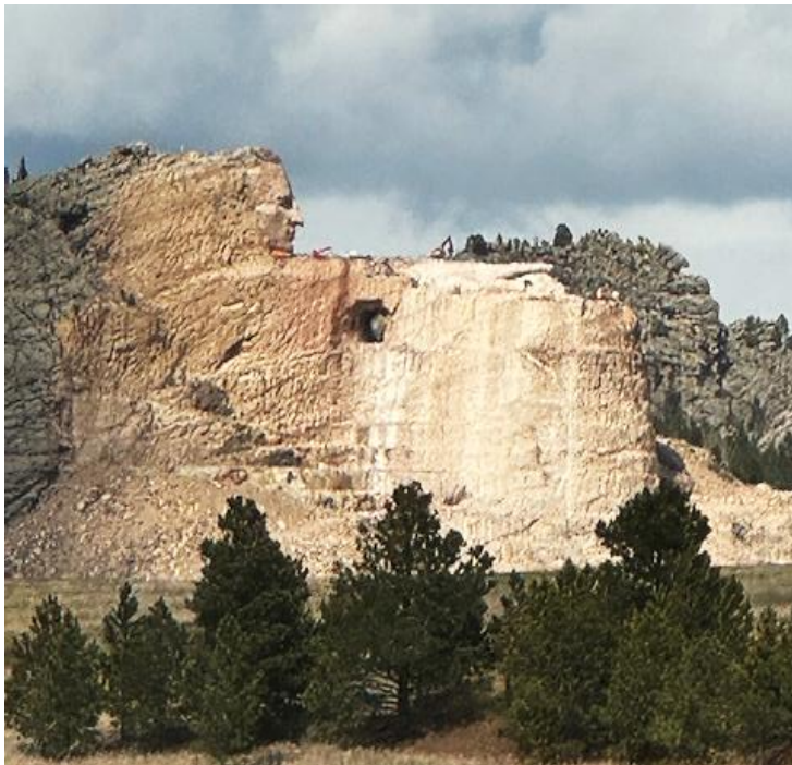
Crazy Horse Memorial, April 2024

The following day we drove south through the Black Hills and toured Mount Rushmore National Memorial. Visiting it for the first time we could easily see, looking left to right, the money running out by