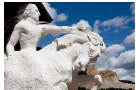
Model of the planned Crazy Horse Memorial when complete.

hand are said to be finished, with the arm, shoulder, hairline and the top of the horse's head scheduled to be completed by 2032. Comparing what has been done since 1948 with the plan, we wonder if, like Mount Rushmore, the final version will be anything resembling the vision. Carving mountains is a bold proposition indeed. Saying goodbye to our blackjack friends, we drove 100 miles east on I-90 to our next stop, the unearthly landscape of Badlands National Park. Passing through Rapid City, on the eastern edge of the Black Hills, we noticed that the new car dealers next to the