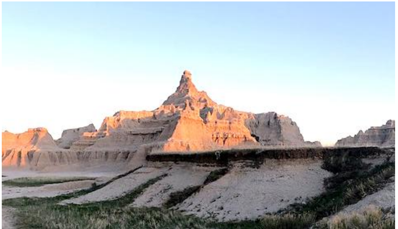
Castle formation at sunset.