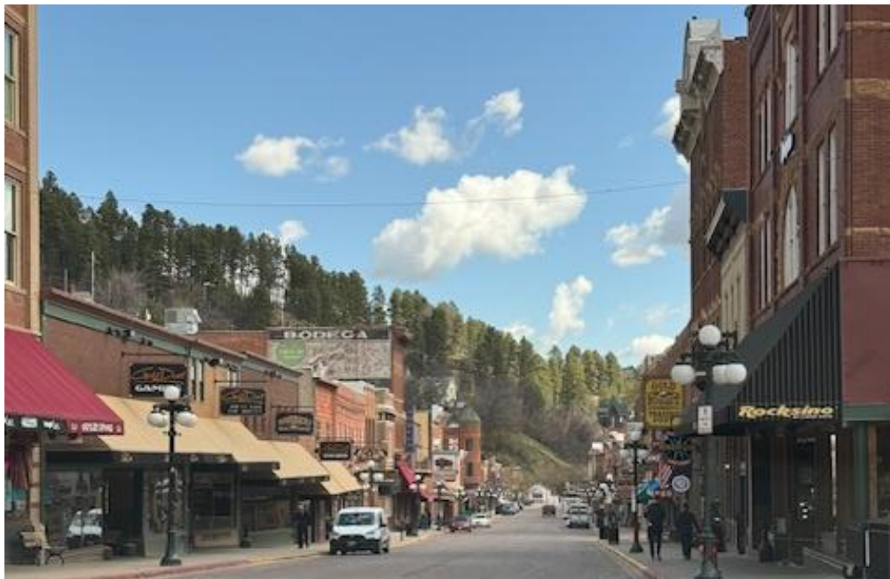
Looking south on Main Street, Deadwood South Dakota, Sunday morning.

Founded in the frenzy that followed George Armstrong Custer's 1874 announcement of finding gold in the Black Hills, within two years Deadwood went from not existing to a town of about 25,000 people that was well known for its lawlessness (it was an illegal town in Native American territory and thus outside the laws of any government) and violence: Wild Bill Hickock was murdered while playing cards