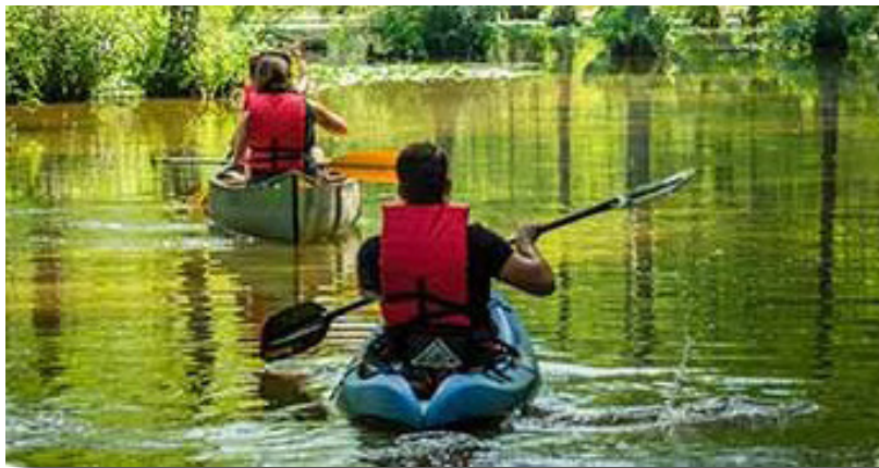
68th Airstream Club International Rally - August 23-28, 2025