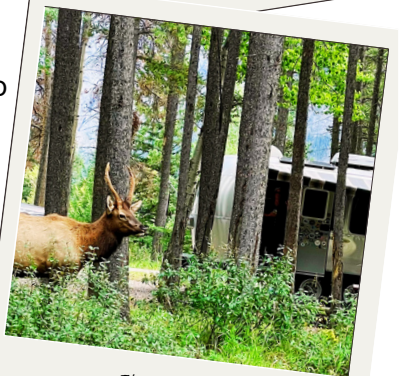
Elk in Banff! Lori Grassi BRN716