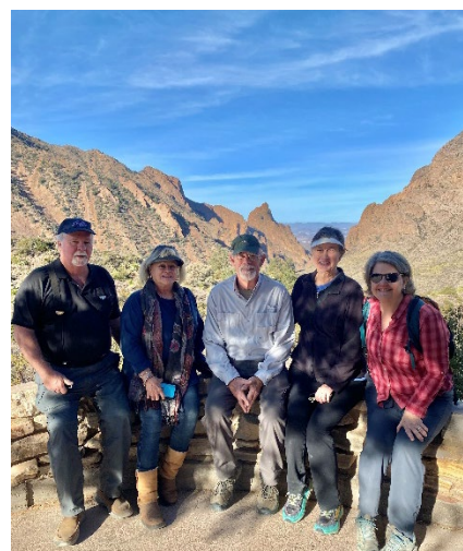
ARAC club members had a great time in Terlingua, Texas and Big Bend National Park (pictured above).