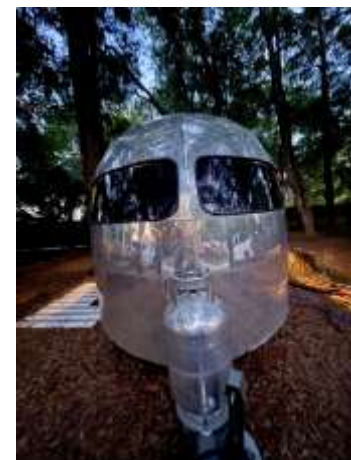
Our Texans in their Curtis Wright 1949 Clipper