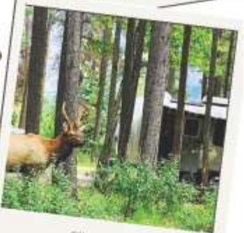
Elk in Banff! Lori Grassi BRV15089