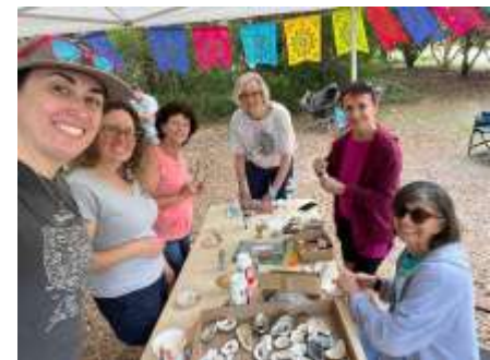
Grateful for the Kitchen crew!