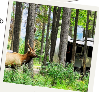
Elk in Banff! Lori Grassi BRN716