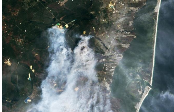
The northern part of the pine barrens fire near Barnegat Township. Holly Acres campground is about 30 miles further south.

For this year's Unbutton rally the club went to the Pinelands National Reserve area of the New Jersey pine barrens. Designated by Congress as the first national reserve in 1978, it was subsequently named as an International Biosphere Reserve by the United Nations. Development in the National Reserve is