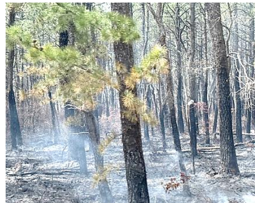
Smoke rising from the forest floor beside the Garden State Parkway.

this one the result of arson. After the Parkway reopened everyone who took it to get to the rally could see smoldering ashes and sometimes fire on both sides of the road. Fortunately, by that time the fire was well on its way to being controlled, and the prevailing winds pushed the smoke from the remaining fire away from our campground.