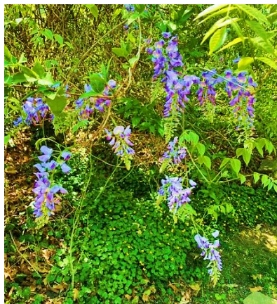
Chinese or Japanese?

As it happens, the weekend of the rally coincided with the blooming of the area's wisteria vines, yielding explosions of lavender in the tops of trees throughout the pine barrens.