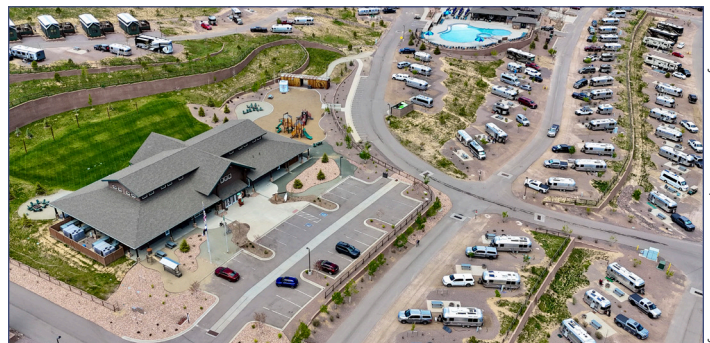
By Rich Howarth | Maintenance Rally

If you've never been to an Airstream rally, I can't recommend it enough. And if you've never hosted a rally, I encourage you to volunteer. Without hosts we can't rally. Go for the scenery – but rally for the friendships. You'll drive away with more than memories. You'll leave with a few more friends, and maybe, if you're lucky, a camping companion for your next adventure.