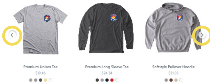
Premium Unisex Tee

Large selection of quality shirts with large or small logo in color or grey. Use arrows on website to scroll right or left to see more selections. (note: UNISEX sizes - women may want to order a smaller size)