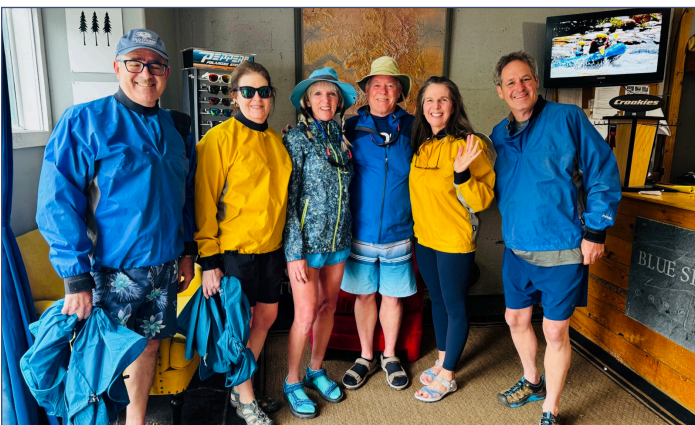
STEAMBOAT RALLY 2025