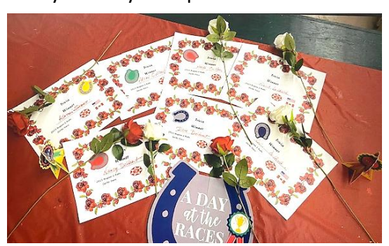
Trivia winner certificates for the WAC team.

The Region 2 Rally at the Grange Fairgrounds, Centre Hall, PA got off to a fun start. Although as promised, it rained on and off all weekend, we managed to do everything we had planned on doing in the surrounding areas. There are plenty of small towns including a nice brewery and lovely scenery to explore. Penn State has a beautiful campus and a fun town surrounding it so