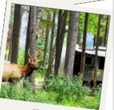
Elk in Banff! Lori Grassi BRN716