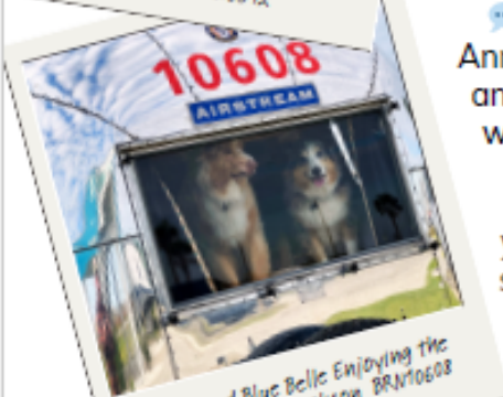
Hank and Blue Belle Enjoying the Scenery