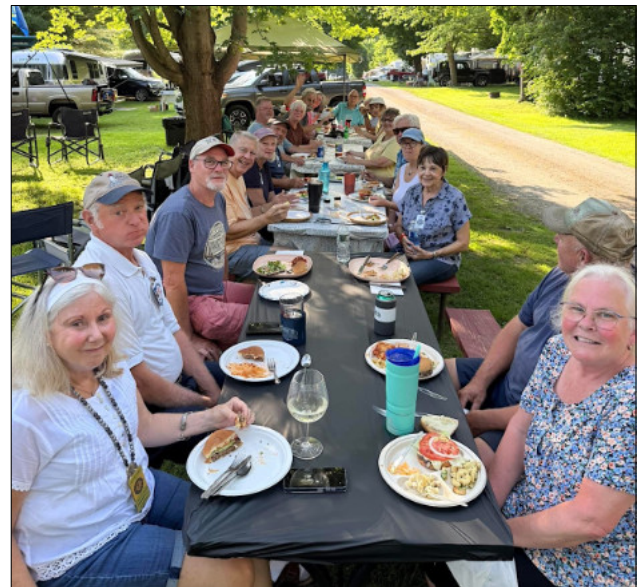
We never go hungry at a Pastures Rally.