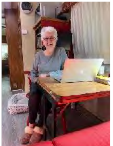
Doing our newsletter in my Airstream at Earl's Cove where I will be spending a lot of the summer months