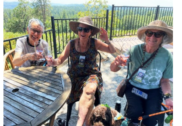
Scenes of the Grass Valley Rally