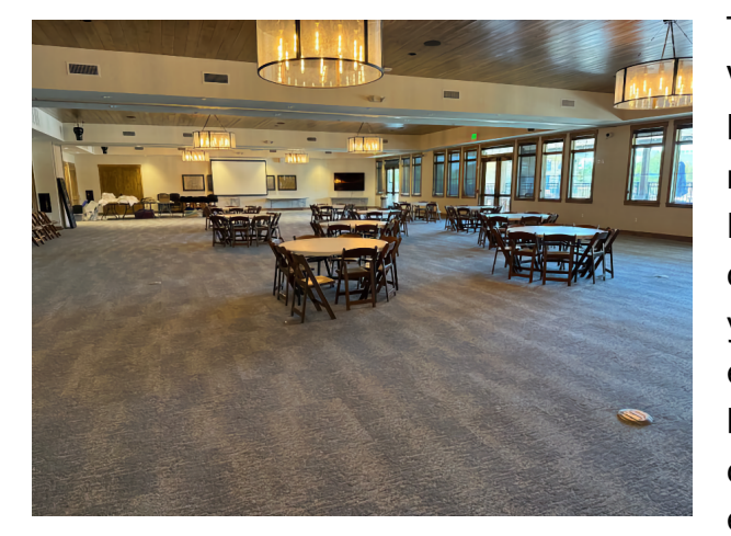
Spacious meetings for our seminars

between regional activities, you can hike or explore the beautiful town of Granby. You should not be bored! And for those of us getting out of the hot desert heat, cooler temps is also on the agenda!