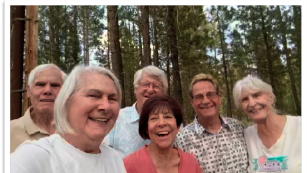
La Pine OR