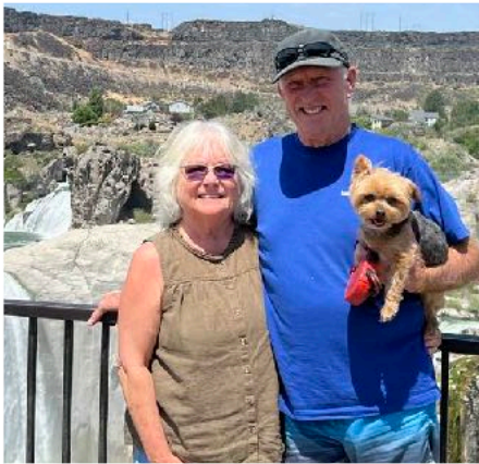
Twin Falls ID