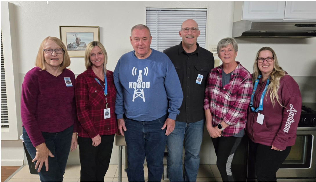
SVAC Installed Officers 2025