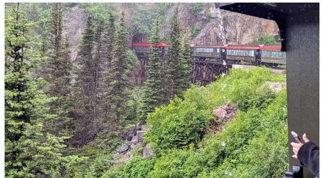
Whale Watching in Juneau; Glacier Activity in Ketchikan, Foggy Train Ride in Skagway – Memories!