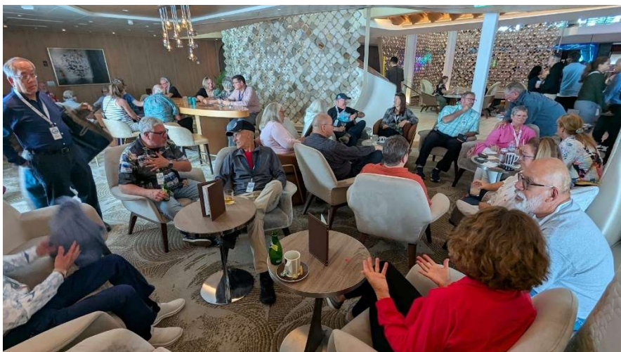
Happy, Happy Hour