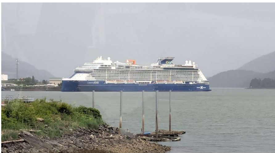
Docked in Juneau