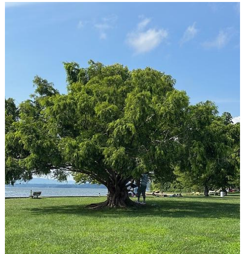
On of the many specimen trees in the park.

Croton Point is a 500-acre thumb of land that juts out into the widest part of the Hudson River and marks the northern end of the Tappan Zee. Humans have made a living on Croton Point for at least 7,000 years, first fishing, later growing crops, and making fine wine and bricks (there's a combo!). Westchester County bought the land in 1923 and turned it into a combination park and landfill, the latter of which was closed some years ago and is now crisscrossed by hiking trails. Today, in addition to its commanding views of the Hudson and the New Jersey Palisades, the park includes fields for baseball, soccer, and cricket, among other sports, rentable cabins and pavilions, a number of spectacular specimen trees, and most importantly for the club, a large campground with spacious sites nestled under maples and oaks.