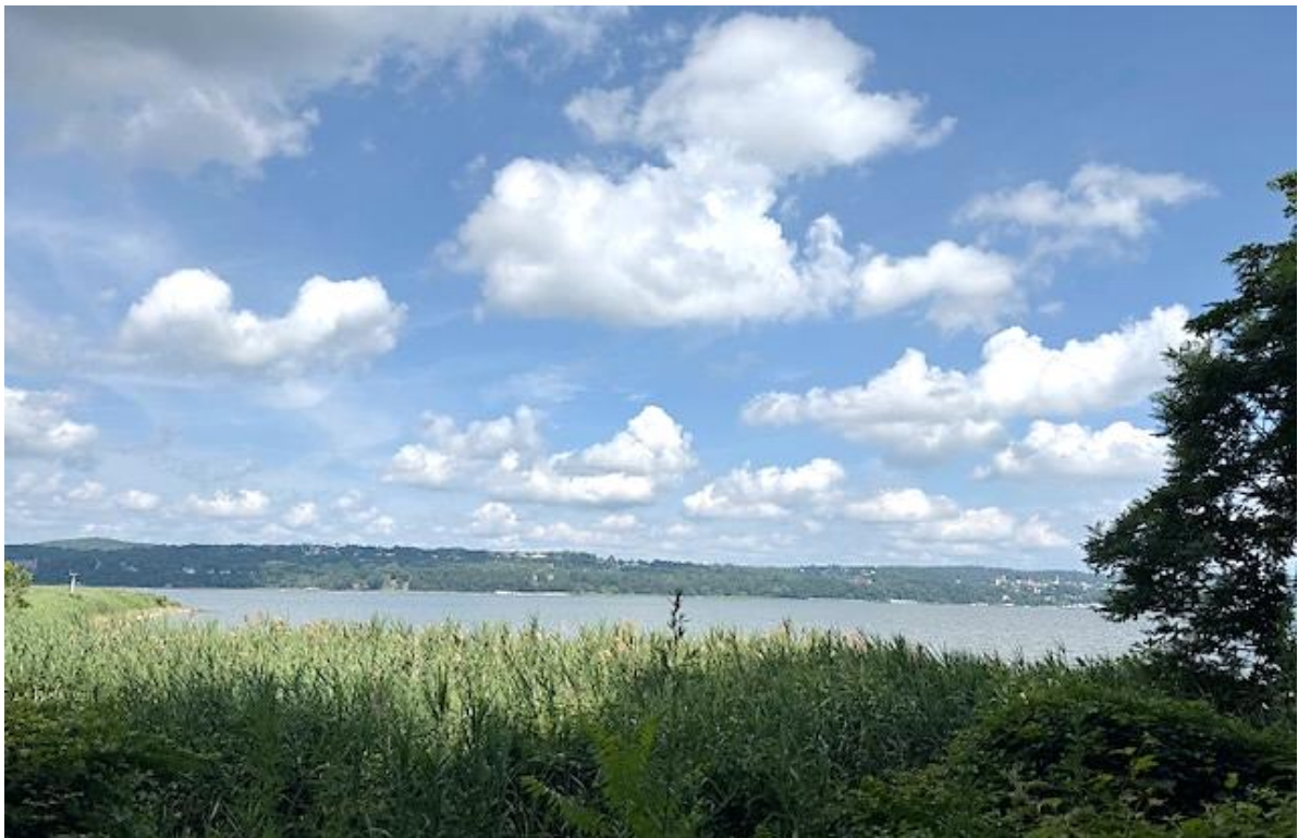
Saturday in the park, no rain!