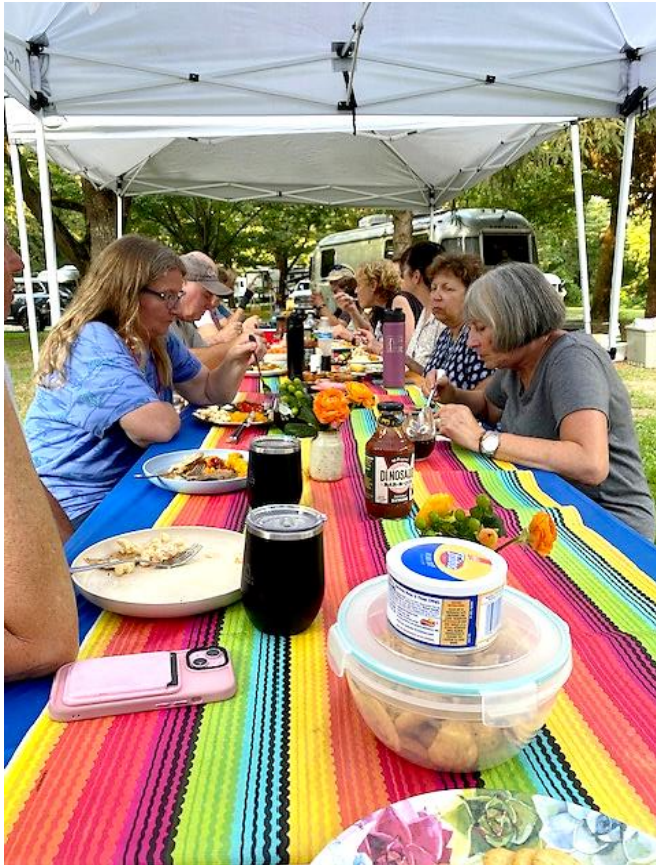
Dinner under the big tent.