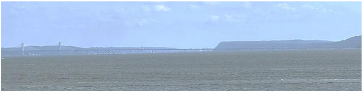
The view south from the park takes in the Tappan Zee, the eponymous bridge, and the volcanic cliffs of the New Jersey Palisades.

Friday the skies were still grey, but a bit brighter. Everyone checked the weather on their phones. No rain on Friday! Saturday still didn't look great, but at least we got a reprieve for one day. By Friday afternoon the sun was out; beastly hot and humid but at least no rain. Checked the weather again and behold, no rain for Saturday, and no rain until late on Sunday! We lucked out.